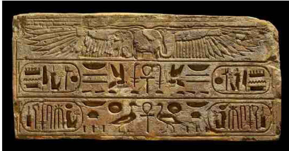
Limestone lintel of Ramses III

We are very excited to announce that from Saturday 21 st October 2023 until Sunday 18 th February 2024, Torquay Museum will have the privilege of hosting A British Museum Touring Exhibition, Egyptian hieroglyphs: unlock the mystery. During this time, we will also be offering a Hieroglyphs workshop alongside our Embalming workshop. Bookings will be taken strictly on a first come basis. Please book soon to avoid disappointment.