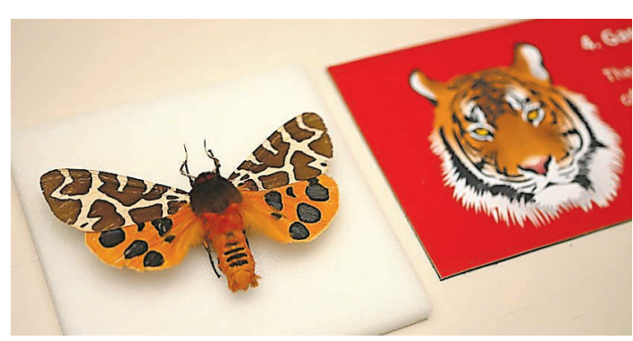
New Tiger Trail in the museum

These animals - and a mineral tend to share a general colouring and patterning which has linked