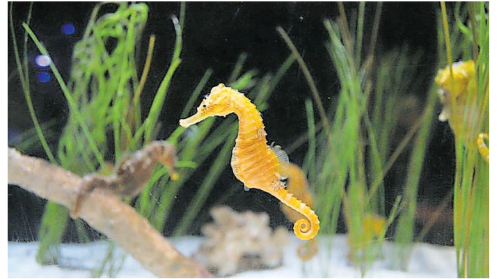
The lecture Seahorses Breeding in Captivity by Tim Haywood will be held on March 30

Torquay Museum Society does more than organise lectures. It also provides voluntary support to the work of the museum, helping with many different aspects of running it.