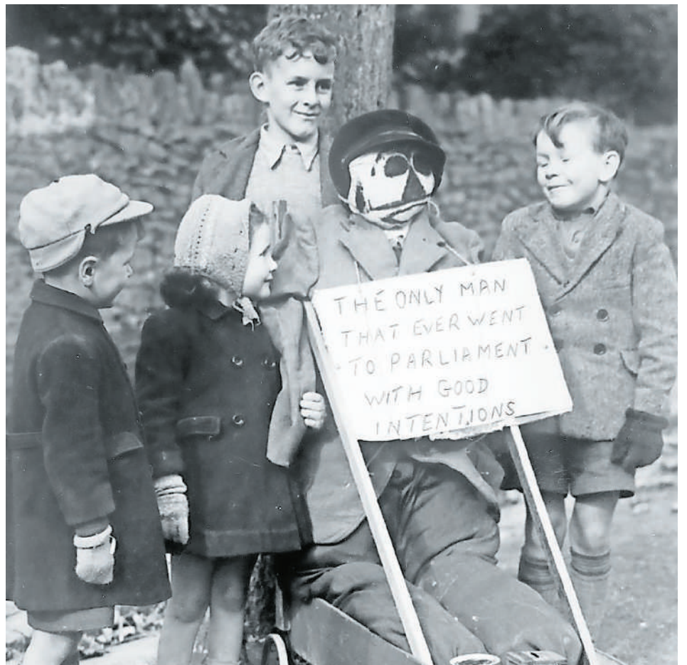
Local children standing proudly by their Guy Fawkes figure. The figure holds a sign which says: "The only man that ever went to parliament with good intentions" (PR25316.238)