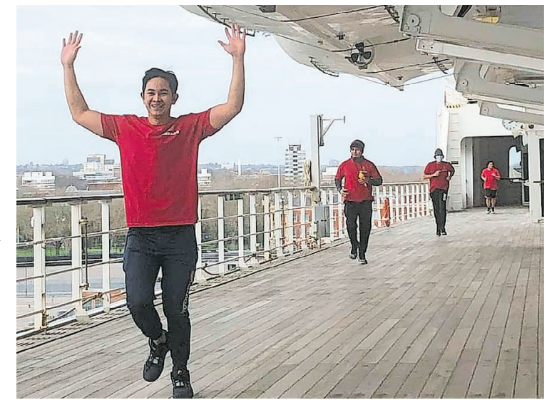
Big smiles during the Easter weekend relay marathon on Queen Mary 2 \,