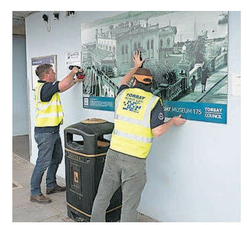
The installation of the Marine Spa graphic by Torbay Direct printers.

Find and name ten objects and bring your list to the museum when it reopens to claim a prize! You can see these objects in the Secret Museum Exhibition at the museum from June.