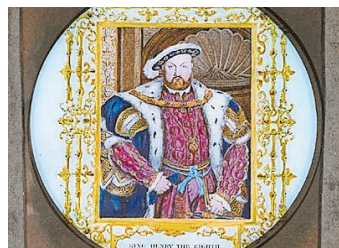
A newly catalogued lantern slide

Torquay Museum encompasses four floors and requires an ongoing program of maintenance and monitoring.