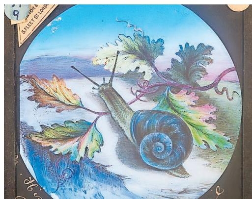
The museum is weekly posting a selection of lantern slides on its social media.