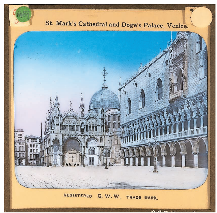
Commercial slide of St Mark's Cathedral and Doge's Palace in Venice (PR37002)