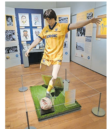
The Torquay United exhibition in 2016

with much larger institutions such as the Natural History Museum or the University of Exeter which supply objects and much-needed specialist knowledge that make these exhibitions possible.