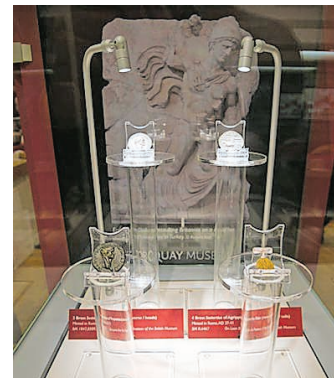
Coins from the British Museum on display in the Ipplepen exhibition of 2018