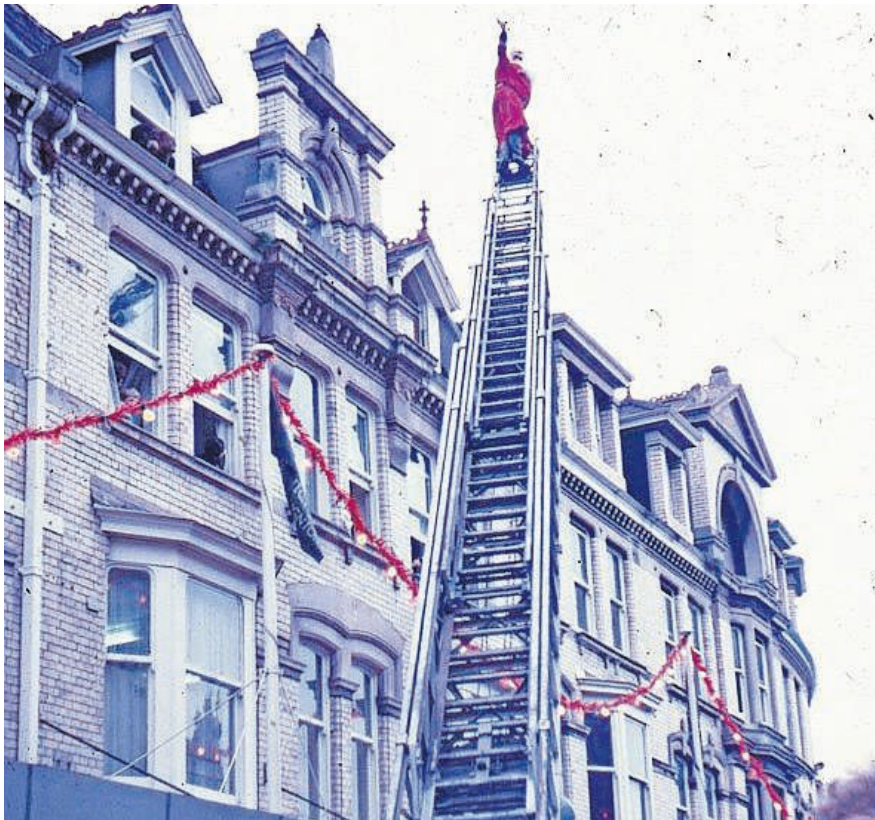
Father Christmas balances on a fully extended ladder outside Rossiters, December 1971 (PR25887)