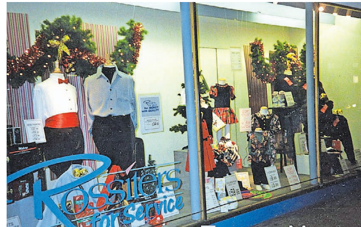
The Christmas window display in 1993 (PR25634)