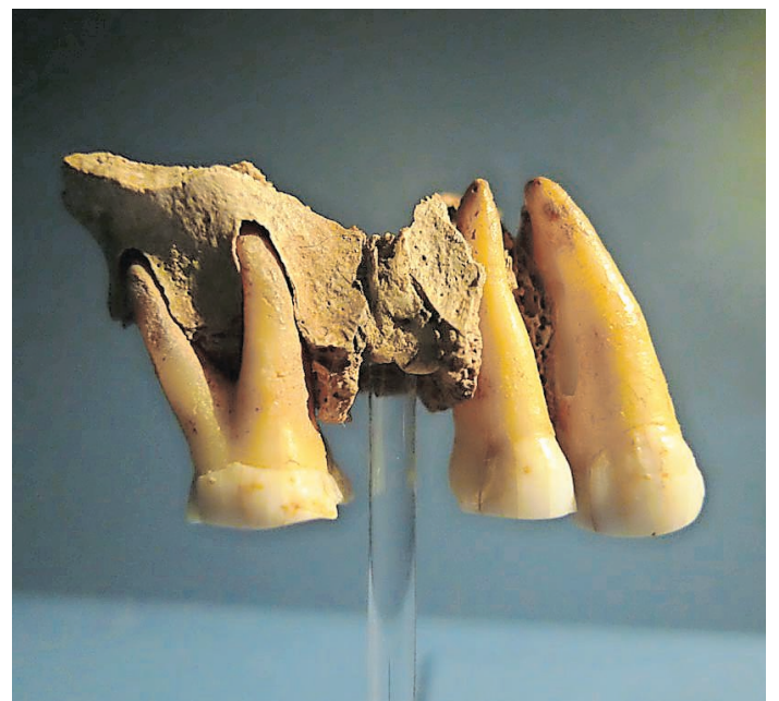
A fragment of human jaw (KC4)

• Photographs from Torquay Museum's archive can be purchased by quoting their PR number to enquiries@torquaymuseum.org. The museum is a registered charity and the money raised from purchasing images goes to supporting vital work looking after the collections.