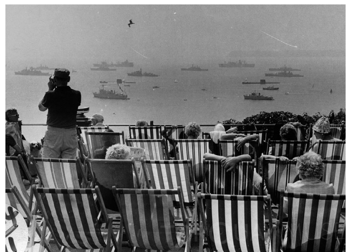
The Fleet in Torbay and the presentation of a new colour to the Royal Navy aboard HMS Eagle, July 28-29, 1969