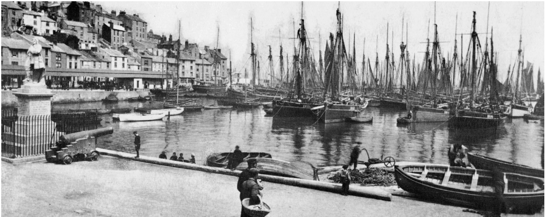
Fishing Fleet in Brixham