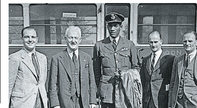
Paignton Regatta sports committee welcoming Arthur Wint at the Paignton train station, August 1949.

In the end the athletes from the tiny Caribbean island triumphed by one-tenth of a second for Olympic gold and a new world record.