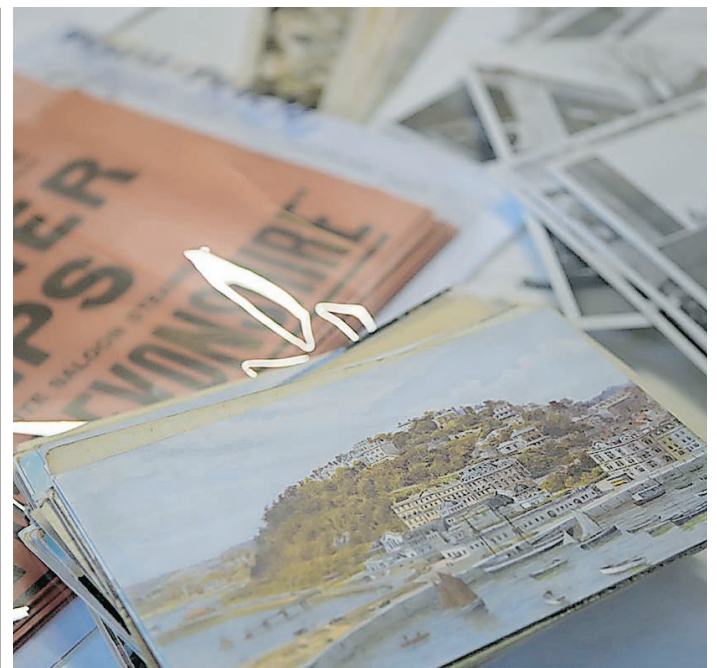
New additions to the museum's archive awaiting cataloguing

In addition to images of certain areas of Torbay underrepresented in the museum's archive, staff are also looking for photographs of life during the pandemic. They could show anything from empty shop units to queues in front of supermarkets and people social