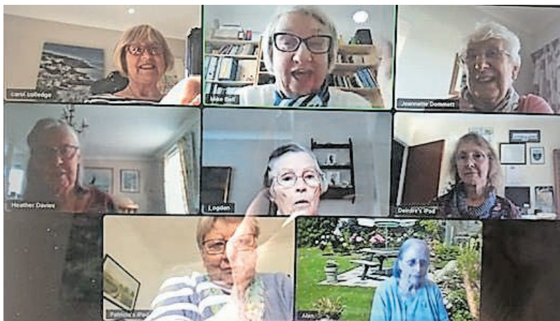
Members of Torbay Inner Wheel Club during their very first Zoom meeting

The Inner Wheel Club of Torquay held its first virtual club meeting last week and enjoyed meeting up at long last.